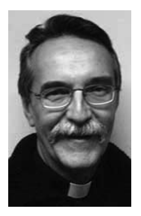
Michael Pollesel, General Secretary of the Anglican Church of Canada

The word "sanctuary" has many meanings. It can refer to the consecrated area of a church, temple or synagogue, especially around its altar or tabernacle. It also can mean a place of safety and protection. Centuries before Christ's birth, sanctuary was a place where criminals could seek asylum in designated "cities of refuge," as described in the Torah. For many centuries since then, people have been able to claim asylum or sanctuary by seeking refuge in churches in different countries.